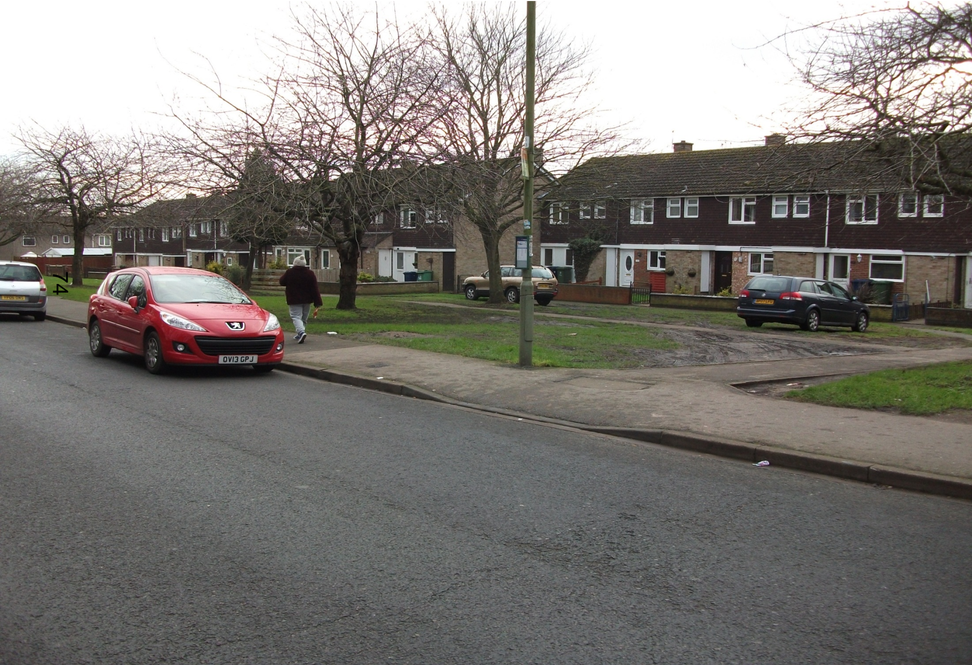
View of site from opposite side of Blackbird Leys Road