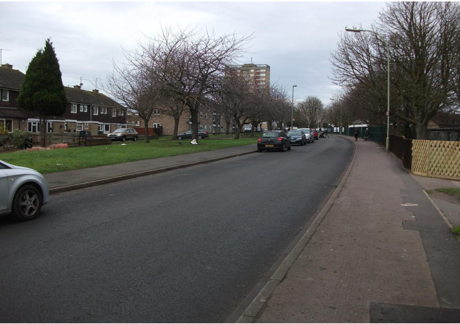
View from junction with Evenlode Tower car park