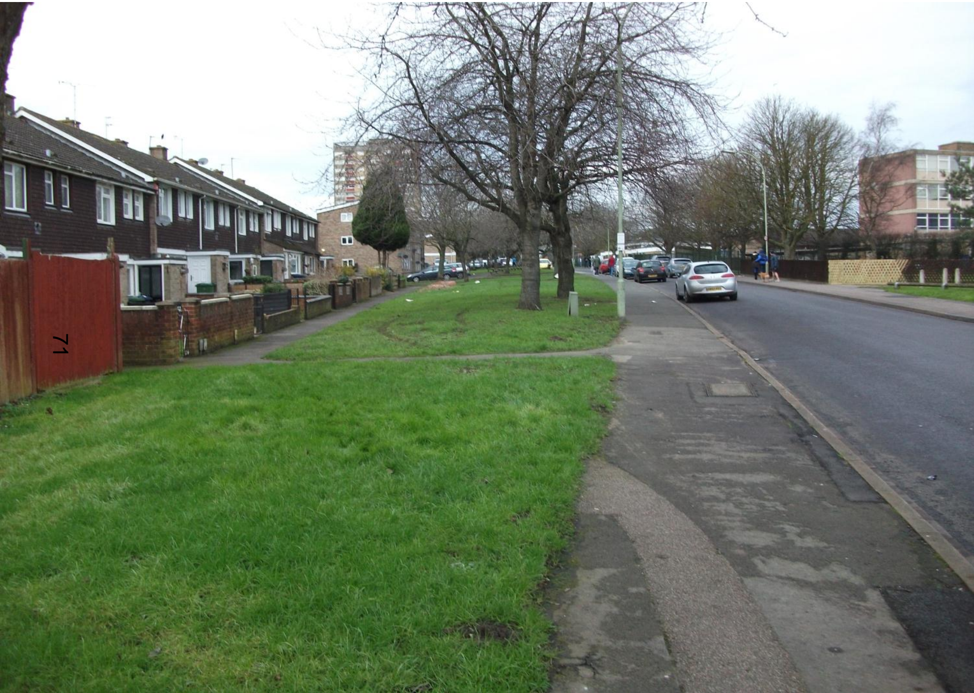
View down Blackbird Leys Road at south –east of site