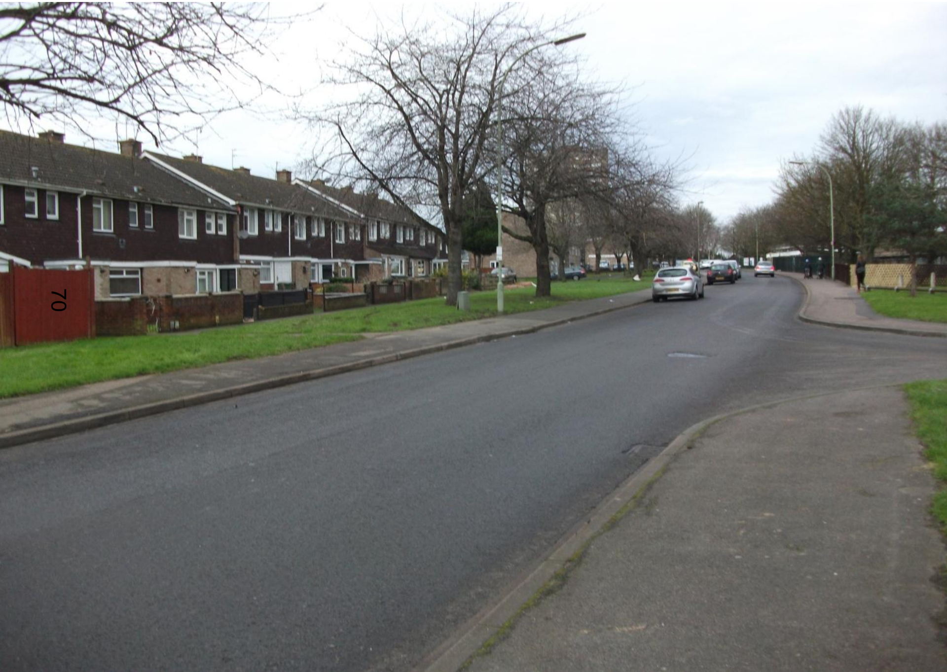
View from Pegasus Road Junction